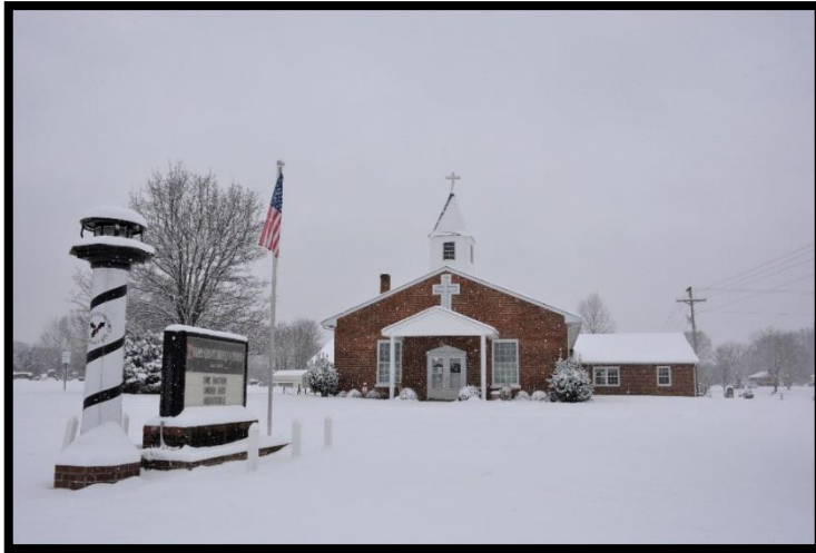
The Church in the Snow